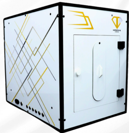
VISION JD 360 PREMIUM